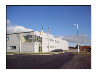
Minelab International Ireland

This paper aims to provide objective information to assist procurement staff to make informed judgement when considering the purchase Minelab metal mine detectors. It is hoped that when all the "procurement considerations" are taken into account, it will be concluded that Minelab continues to represent excellent value for money.